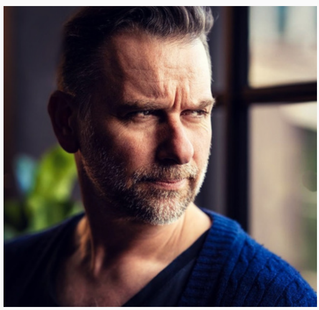
Term 2 will see actors get physical and focused through training in: